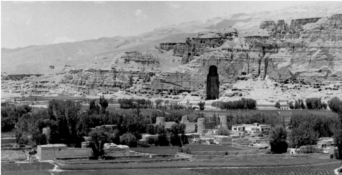
[wPĀ : The Bamiyan Valley in 1963, Afghanistan]

AvšRtj i http://www.qantara.de/ Gi AvKŮBtF G>Uvi w` tZB tPvL AvUtk tMtj v GKUv BwZnvtmí ü` wctÉ| `úU AvdMwb` vb| 1963 mvjtj avi YKZ The Bamiyan Valley-i QweUv bv t` Ltj Dcj wä Kiv hvte bv Kx wekvj tMŠie Avi HwZn" aŋi AvtQ I Uv| we`Z Gj vKv Rto tdvKvm Kiv QweUvi th RvqMvUvtZ wMtq ARvtšB tPvL AvUKvte, Zv ntj v, `ŋi i cvnvoUvi gvS eivei mwekvj tZvi tbi gŋZv cŋek gLUvtZ| wecj wekvj Zv wbtq tMŠZg eŋxi cwi wbeŋtbi GK mg,x fv` h?